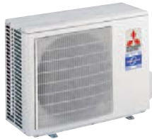
Outdoor unit PUZ-A18NHA